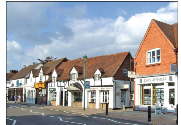
High Street looking north

Knowle Local History Society is an independent organisation formed to promote the study of the history of the village and to provide a service to the residents of Knowle and the wider public.