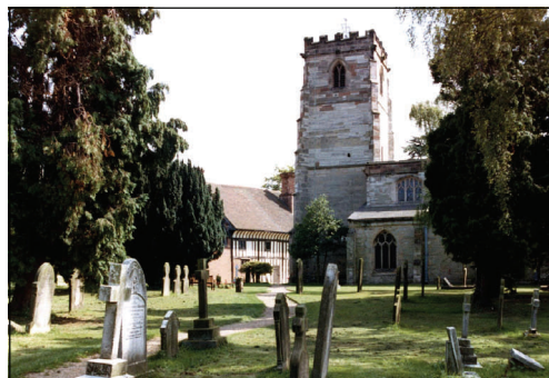
The Church and Guild House from the north

The Society is happy to take parties round Knowle's early 15 th century church and Guild House, subject to the agreement of the Church and whether or not they are available . Apart from the usual Sunday services there is a communion service in church on Wednesday mornings, followed by coffee in the Guild House. Weddings, funerals and other events may have been arranged; the Guild House is in regular use. Members of the Society are usually on hand to answer questions for the Saturday of Heritage Open Days weekend (second weekend in September).