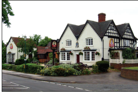
The Wilson Arms

There are several suitable starting points, depending on the group's plans before and after the tour. Probably the best is The Square; the tour can then start at the church before going along Kenilworth Road. One can then return to the church and proceed along High Street, ending at the north end of the village. Other suitable starting points are the library or the Wilson Arms.