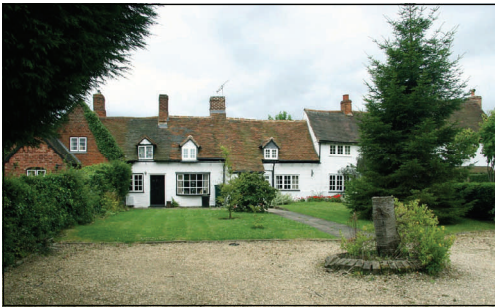
Golden End cottages

A tour taking in The Square, Kenilworth Road and the church takes about an hour. An hour and a half is the minimum time to include High Street and the Solihull end of the village. This allows time to go round the exterior of the church, but very little time to go inside. Subject to the agreement of the library staff, groups may go inside the library, but extra time may be needed. Note that the library is closed on Wednesdays.